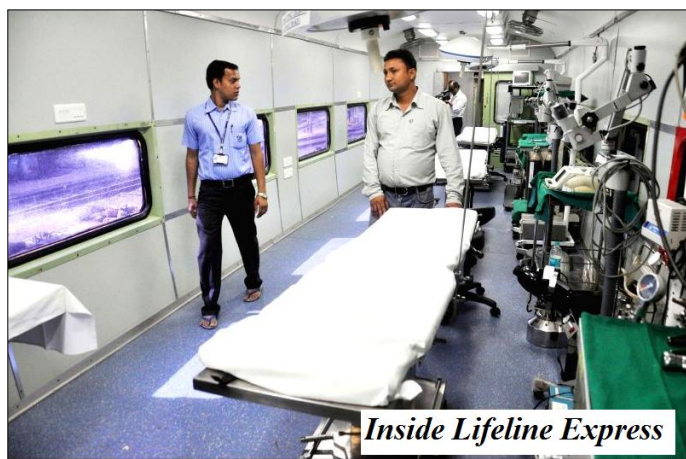
Inside Lifeline Express